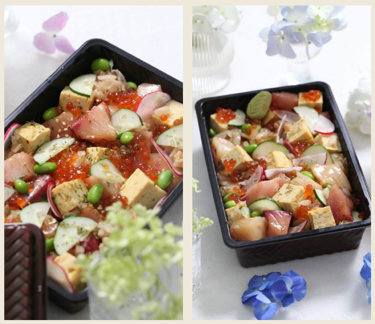
Left Hamachi Chirashi, Right Scallop & Hamachi Chirashi

Hamachi Chirashi, thickly & generously cut for texture 19.9 Hokkaido Gyoren Scallop & Hamachi Chirashi 22.9