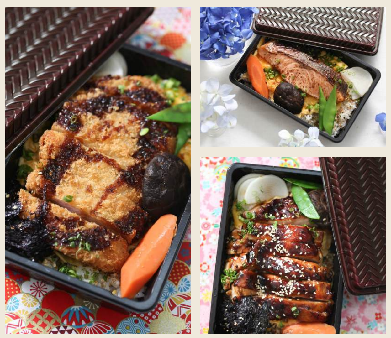
Clockwise from left: Tonkatsu Don, Salmon Don, Chicken Don

Charcoal-grilled Chicken Don (boneless) 13.9 Signature Hickory-smoked Salmon Don 16.9 Tonkatsu Don (pork cutlet) 14.9 Duo Donburi of Smoked Salmon & Chicken (low carb, rice substituted with vegetables) 19.9